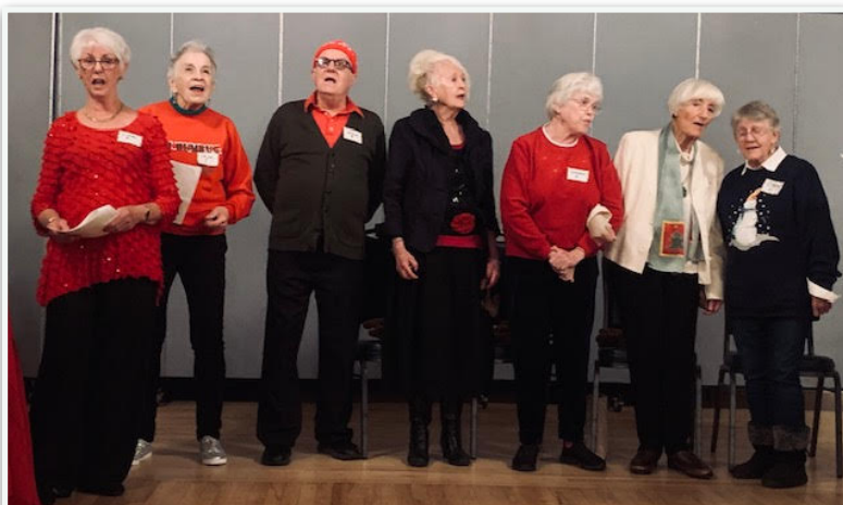
The debut of the Village Singers at the Holiday Party

I was not able to go on the ferry ride because of a family commitment, but I hear it was a huge success.